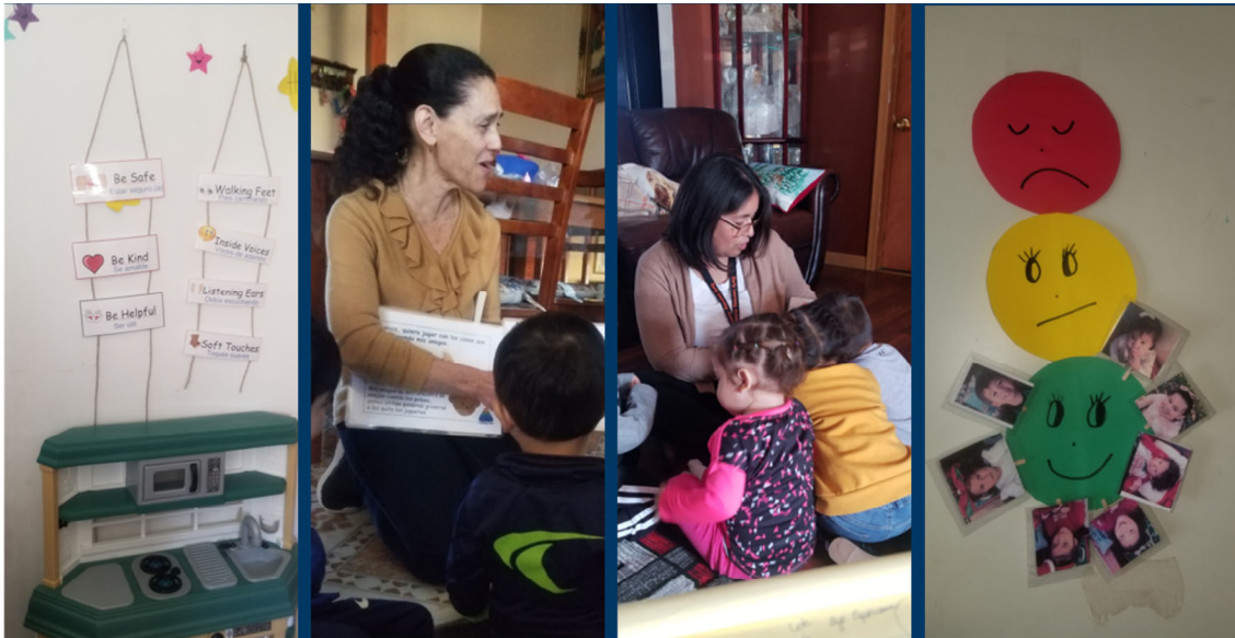
Pyramid Model training for Spanish-Speaking Providers

How do you bridge a gap created by a language barrier, by differing cultural norms and expectations for childcare, by a system without the capacity needed for family demand and lacking at times in resources for Spanish-speaking providers? For 6 dedicated women working in Lexington, Nebraska, the answer may come in small acts of trust.